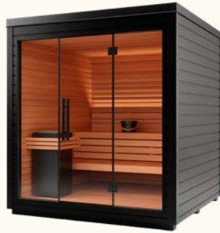
MIRA L in black cladding