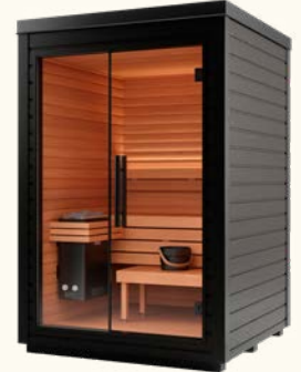
MIRA S in black cladding