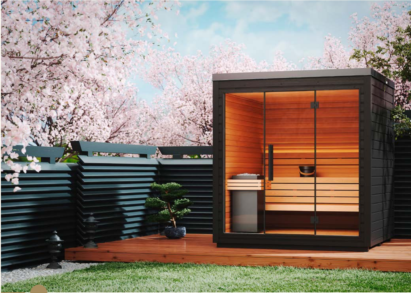
Mira model L in black cladding