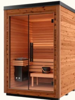
MIRA S in natural cladding