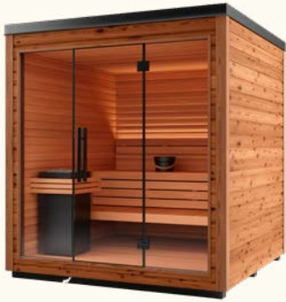
MIRA L in natural cladding