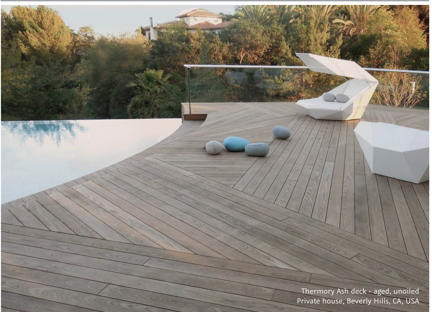
Thermory Ash deck - aged, unoiled Private house, Beverly Hills, CA, USA

Thermory AS procures White Ash from North America and Europe, from regions that take care of the forest responsibly and sustainably.